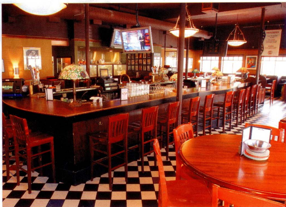
Rudolphs Bar-B-Que hosts two-a-day happy hours every day of the week.